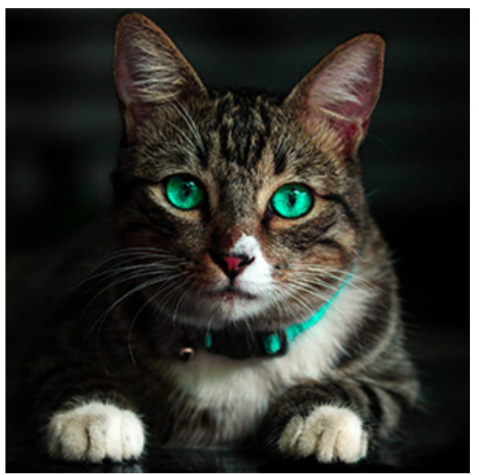
300 x 300 Pixels

There are hundreds of image file formats from the JPEGs and GIFs that make up much of the web to proprietary formats such as those used by Adobe Illustrator and Photoshop. This sea of formats is further complicated by the fact that many types of images can be embedded in other documents such as Adobe Acrobat files, Microsoft Word docs, and emails. All these possibilities make the process of providing usable artwork to manufacturers and printers confusing at best.