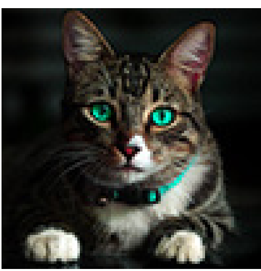
100 x 100 Pixels