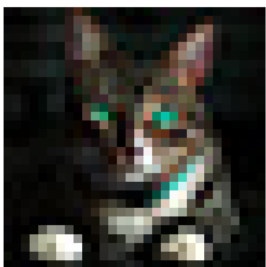
30 x 30 Pixels

Raster images, such as TIFF, BMP, JPEG and GIF formats however, are more like a mosaic made of square colored tiles. These 'tiles' are called pixels, or dots. The shapes and patterns in the image are just collections of similarly colored pixels laid out in the proper pattern. The more pixels in a given space, the higher the resolution and the better the image looks. Raster images are not scale-independent. The bigger you make the image, the bigger the pixels get, until smooth diagonal lines and curves start to look like staircases.